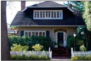
1128 Emerson St.