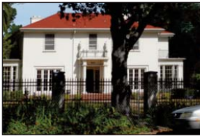
939 University Ave.