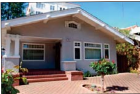
712 Waverley St.