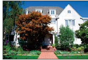
855 Hamilton Ave.