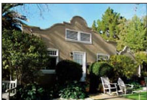
751 Everett Ave.