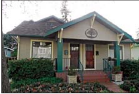
834 Ramona St.