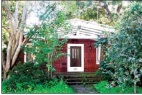
250 Byron St. Irving Brenner