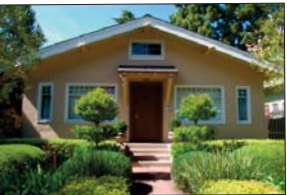
730 Waverley St.