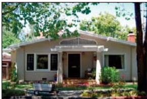
477 Everett Ave.