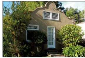
761 Everett Ave.