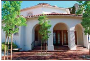
661 Bryant St.