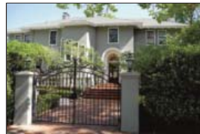
320 Kellogg Ave.