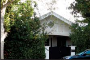
1003 Middlefield Rd.