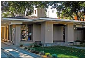
628 Middlefield Rd.