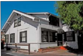
436 Waverley St. John Childress Assoc.