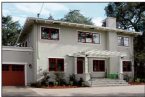
550 Embarcadero Rd.