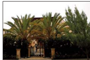
865 Hamilton Ave.