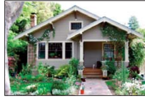
311 Fulton St.