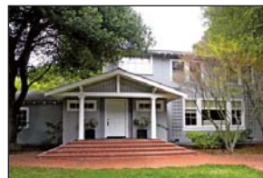
211 Melville Ave. / 1263 Emerson St.