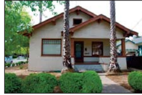
360 Fulton St.