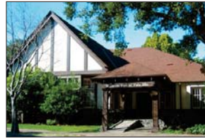
475 Homer Ave. The Woman's Club