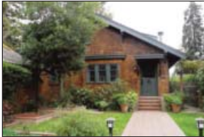
666 Tennyson Ave.